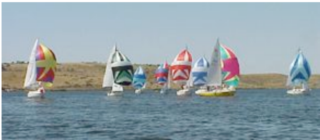
San Juan 21's on a downwind leg at the Western Nationals